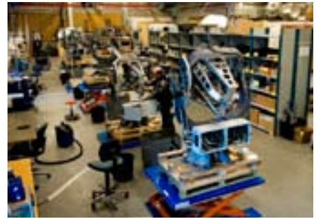
A master line of production and the development of production technology was inaugurated in 2005 in Söderhamn, Sweden and additional production line were taken into operation in Singapore during 2010.